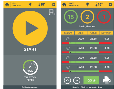
New easy to use touch screen operator interface

Exclusive helix tilting system for more comprehensive thread measurements